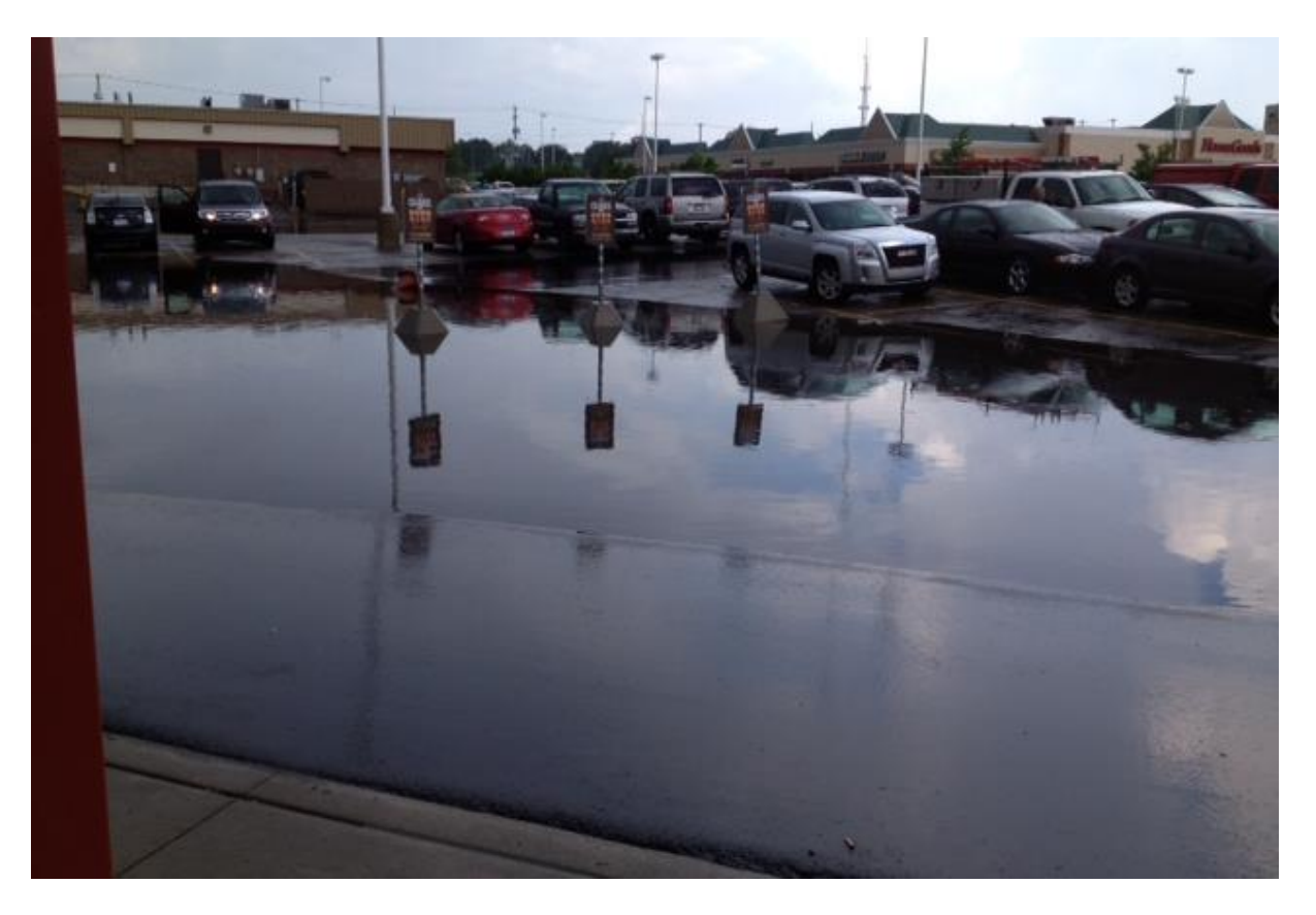
Flooding, Lansing, 2018

To help calculate flood damage that could occur to your home, visit <u>www.floodsmart.gov</u> and click on the link to learn more about "What Could Flooding Cost Me?"