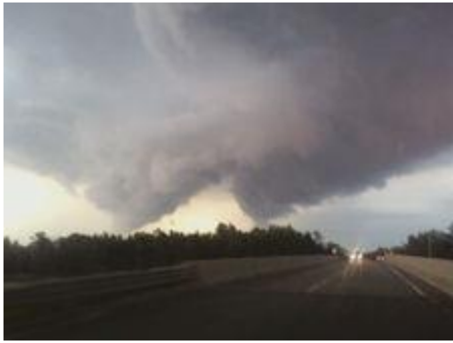
Tornado in Grayling area.