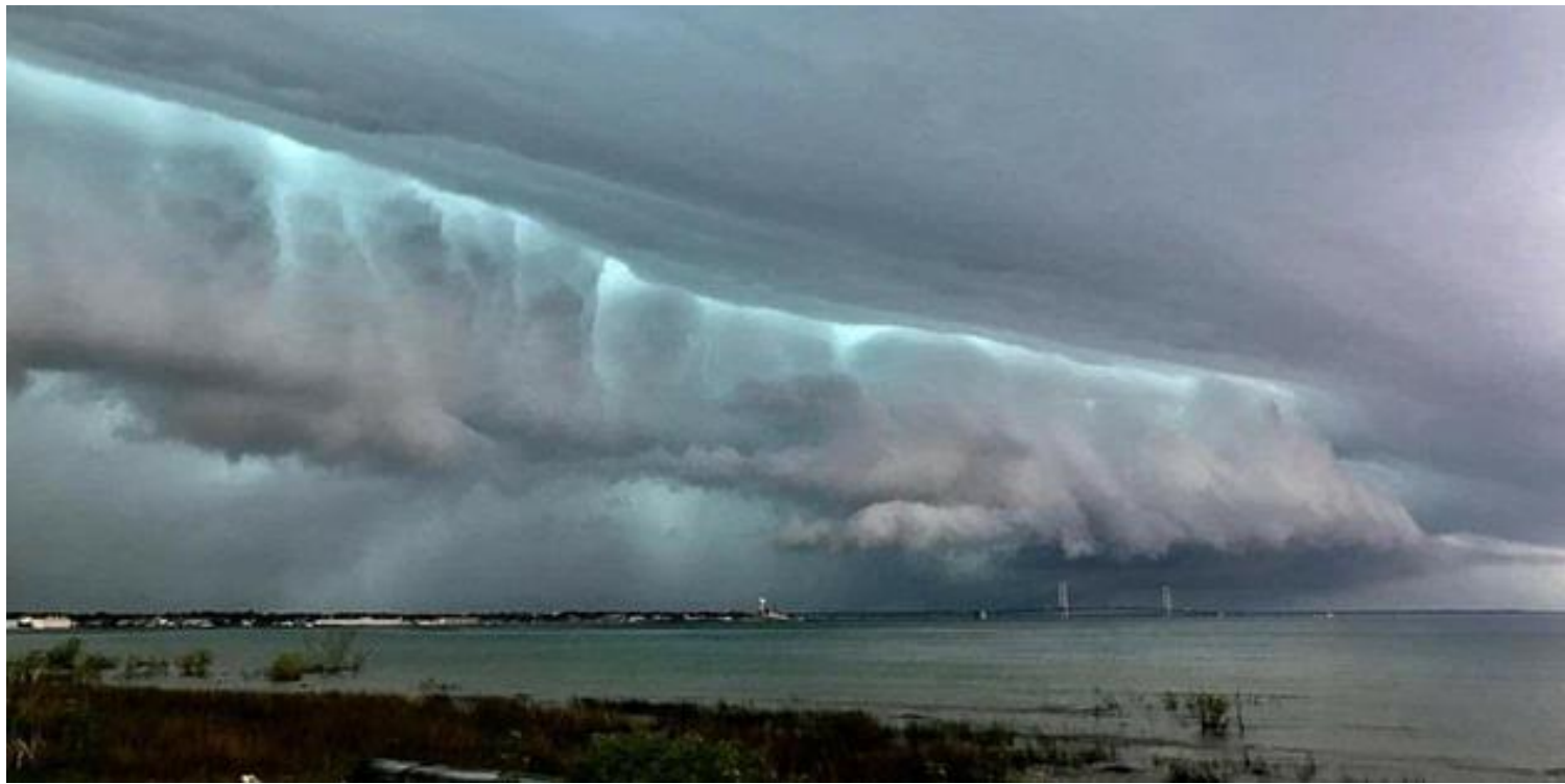
June 11, 2017 severe weather approaching the Mackinac Bridge.

This packet was prepared by the Michigan Committee for Severe Weather Awareness (MCSWA), a coalition formed in 1991 to promote safety awareness and coordinate public information efforts regarding tornadoes, flooding, lightning and winter weather.