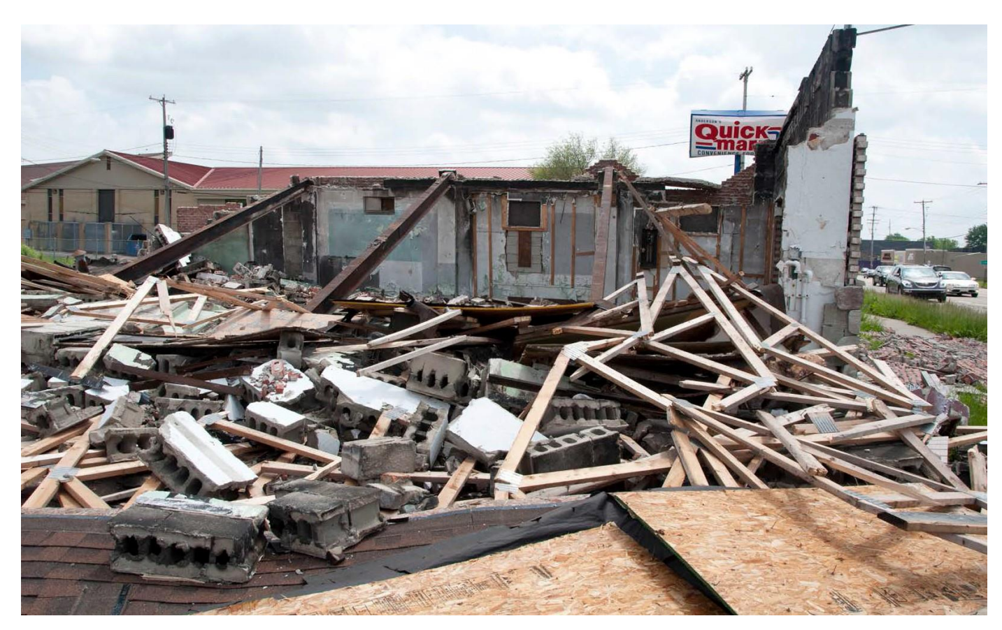
Destruction from a May 2013 Tornado in Genesee County

Tornadoes generally travel from the southwest at an average speed of 30 mph. However, some tornadoes have very erratic paths, with speeds approaching 70 mph.